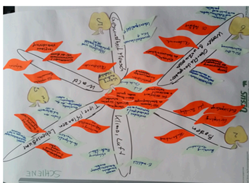
Figure 3. First stakeholder workshop in June 2017 results from the KETSO sequence (Jiricka-Pürerer).

After this first brainstorming session, the stakeholders ranked their results according to the time-span to answer the key questions “What exists in 2037 and what exists in 2017?” and “What was elaborated/adopted after 2017 and who contributed what (responsibilities)?” using the KETSO tool ( www.ketso.com , see Figure 3) to structure the information. In light of the above, scenario narratives were elaborated by the research team based on the discussion with key actor groups during the first workshop. In a second step, priority aspects for the implementation of CCA in EIA were identified and evaluated by the actors.