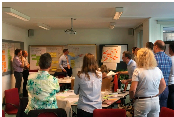
Figure 2. First stakeholder workshop in June 2017 large group discussion (Czachs).

Sequence 3 Data and Information II—“We optimized prevention and compensation measures with regard to climate change”